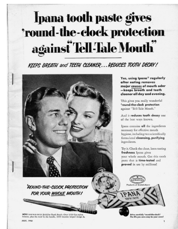
Fig. 8, IPANA AD, Ladies Home Journal , 1950.

ALTHOUGH this is the story of American advertising lettering, a few words about the lettering in European modernist posters of the 1920s and '30s would be appropriate, because this genre has acted as a catalyst, shaping graphic design historiography (which emerged in the