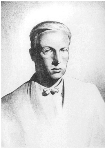
T. M. CLELAND, by Rockwell Kent. Portrait lithograph appeared as the frontispiece to The Decorative Work of T. M. Cleland , 1929.

American hand lettering flowered in its own right around a nucleus formed at the Warne School in Chicago, c. 1900, by Fred Goudy, Bruce Rogers, Oswald Cooper and W.A. Dwiggins—all of whom would go on to produce important typefaces. None of these freelance designers would be able to make a living solely from type design. Not even close, not even the prolific Goudy. They were primarily lettering artists and typographers.