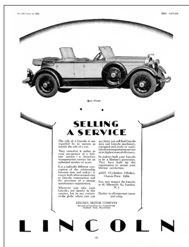
Fig. 6, LINCOLN AD. Artists: unknown. The Tatler , April 11, 1928.

At the same time, there was the age-old practical reason for using hand lettering in emulation of the typographic effect, when adequate display type was simply not available. There were two reasons for this. Firstly, there was very little choice of large type, especially with fine detail, and secondly, the letterers always had the latest styles.