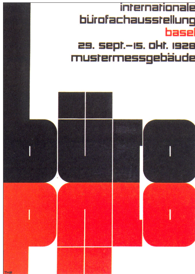
Fig. 9, INTERNATIONAL OFFICE EXHIBITION, BASEL.

Bauhaus style: Bayer's ruthlessly reductive typeface plays the same tubular tune as Breuer's chair. Both men were on the faculty of the Bauhaus.