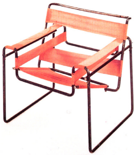
Fig. 10, ARMCHAIR, Marcel Breuer, 1925