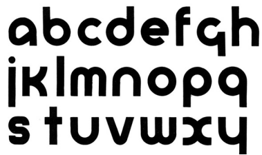
Fig. 11, UNIVERSAL ALPHABET, Herbert Bayer, 1926

Bauhaus style: Bayer's ruthlessly reductive typeface plays the same tubular tune as Breuer's chair. Both men were on the faculty of the Bauhaus.